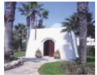
Palm Beach Hotel Larnaca