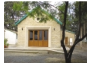
St Barnabas Limassol