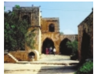
Ayia Napa Monastery