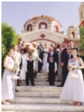
St George's Chapel Paphos