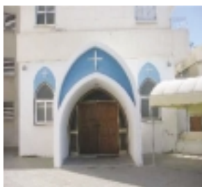
St Helena's Anglican Church Larnaca