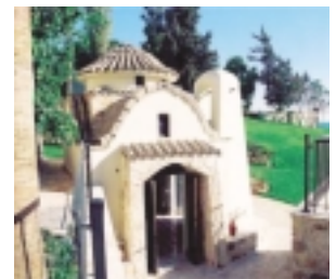
Columbia Beach Resort-Pissouri